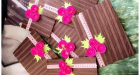
Quilling work on Gift Envelops