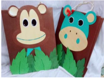
Designer Paper Bags